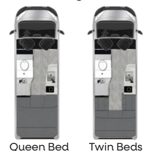
Queen Bed Twin Beds